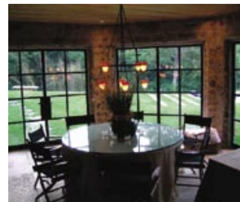
By opening certain walls with large windows and French doors, Kuoppala bathed the remodeled interiors with natural light.

He also occasionally lets the client hold onto a model for a while, to mull it over and get used to what will be their new residence. "The computer rendering isn't out on the table for you to see when you come home from work," he explained, "whereas a model is right there so you can see it and think about it when you pass by." He's also had clients throw themselves a party to celebrate the building of their new home. "They can invite their friends over, and say 'this is our new house!'" With so much invested in such a project and much at stake, enthusiasm can be as great an asset as explanation.