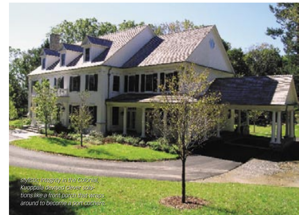
stylistic integrity in the Colonial, Kuoppala devised clever solutions like a front porch that wraps around to become a port cochere.

The new 7000-square-foot home stands on top of the original foot-