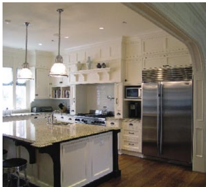
The challenge of creating a functional new home in an historic style was successfully met in the fully modern kitchen.

He also gave them a modern kitchen and a sophisticated climate-control system that monitors the temperature in every room separately. The sleek interiors feature clean, modern lines, while leaving brick exposed for its beautiful textures and using natural materials and surfaces appropriate to the home's exterior.