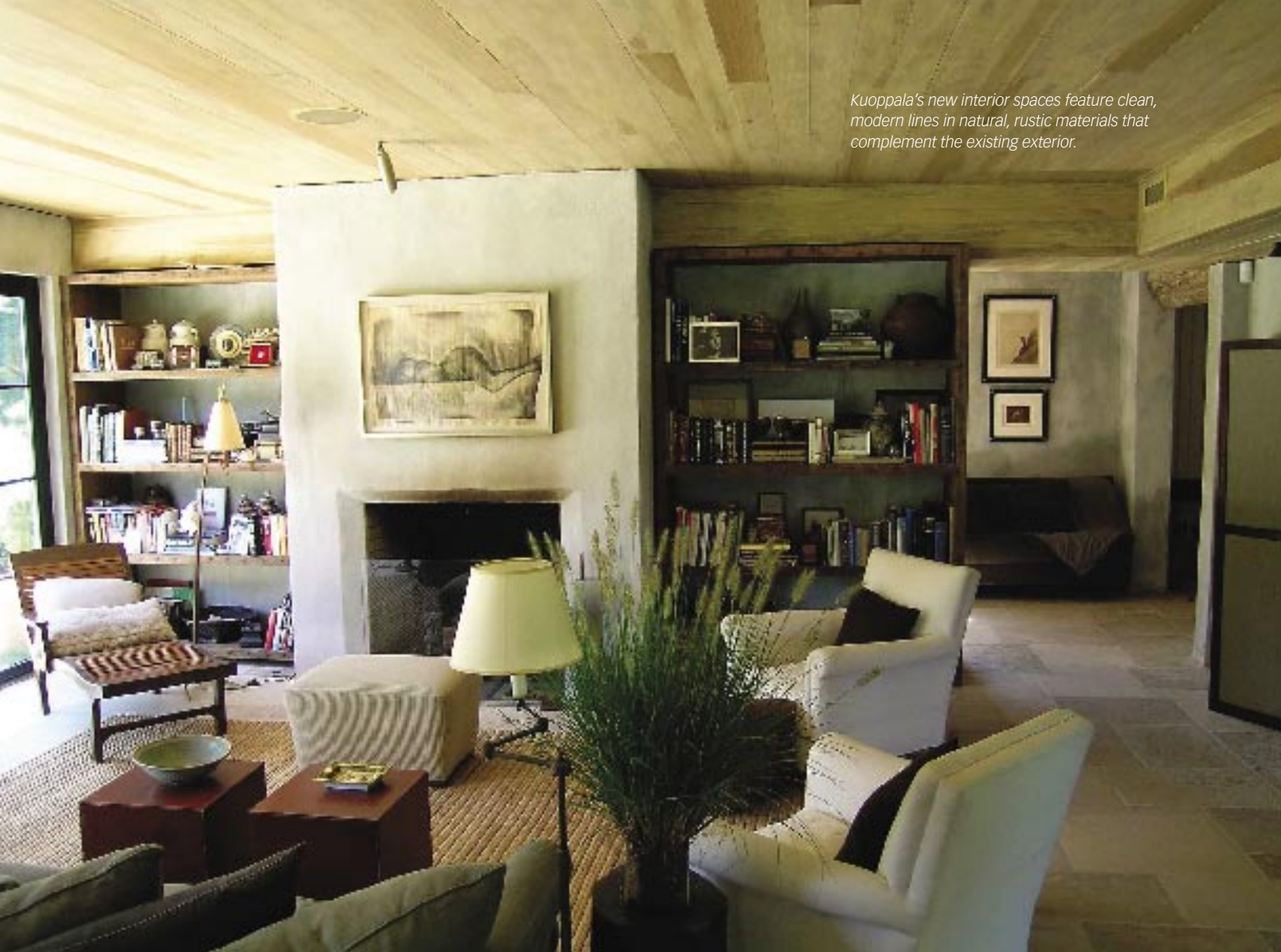
Kuoppala's new interior spaces feature clean, modern lines in natural, rustic materials that complement the existing exterior.

as to make it more livable and pleasant. Opening up some of the walls with more windows and replacing the wooden garage doors on the front façade with French doors brought in significantly more light. He also replaced the bottom half of double hung windows with antiqued glass, minus the diagonal muntin bars, to allow in more sunlight and improve views. "I'm interested in the feelings evoked by the interplay of light and space, how light changes from East to South for instance... something few architects pay enough attention to," Kuoppala explained.