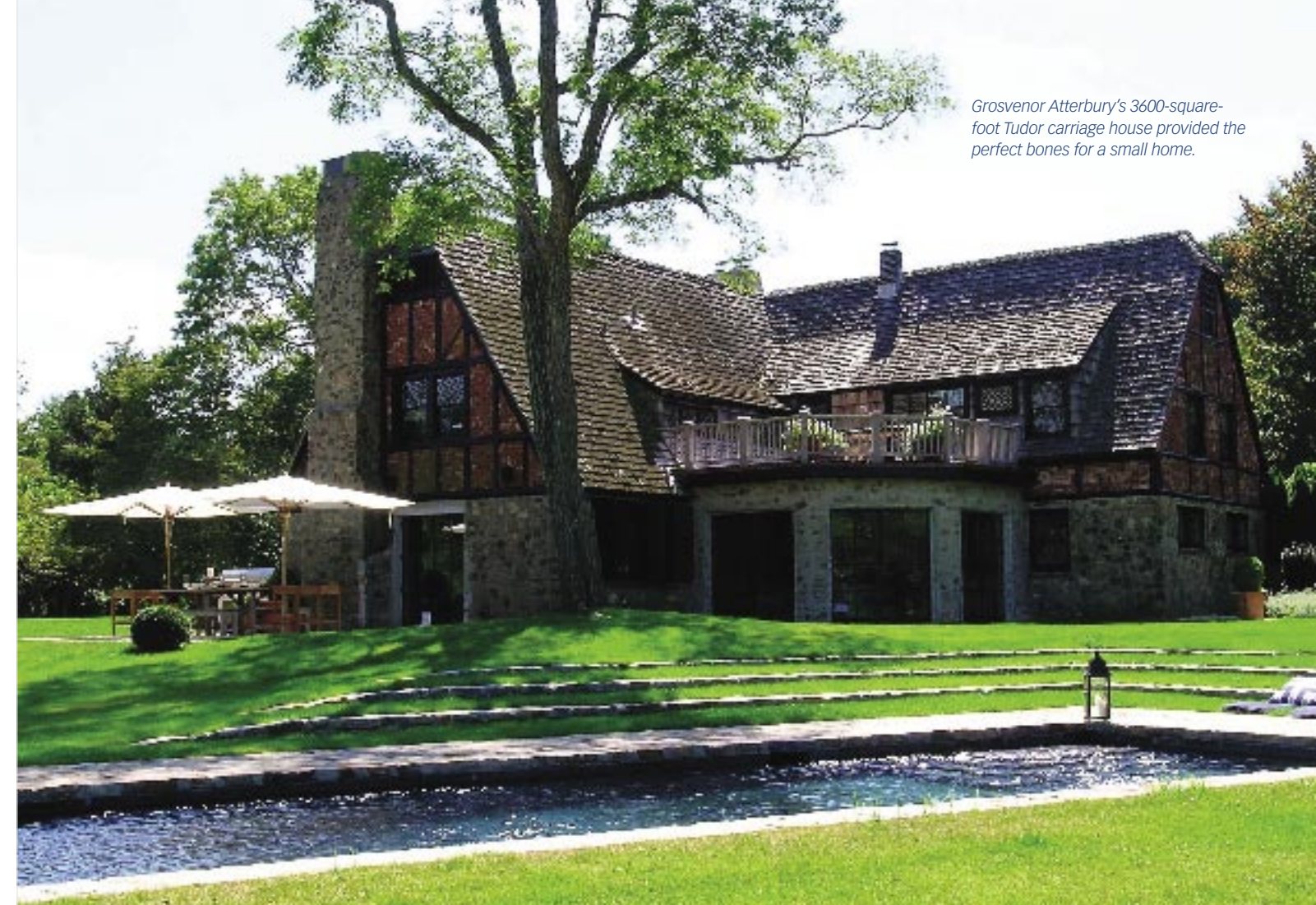
Grosvenor Atterbury's 3600-square-foot Tudor carriage house provided the perfect bones for a small home.